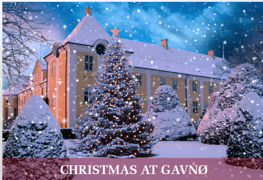
CHRISTMAS AT GAVNØ

Visit Denmark's largest Christmas market with 150 stands in the historic farm buildings from the 19th century. All stands are carefully selected, and we emphasize quality and diversity. Here you will find a large selection of handicrafts, delicacies and food, Christmas decorations, wine and handicrafts.