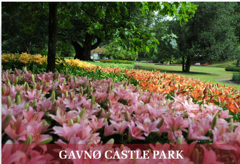
GAVNØ CASTLE PARK

Since the 18th century, the historic garden, has offered large collections of thousands of flowers and rare trees. In April, many variants of the early spring invigilators can be enjoyed, such as daffodils, pearl hyacinths, crocuses and others. In May, the country's well-known and most spectacular tulip exhibition can be experienced. Tulips are replaced by thousands of summer flowers and in August, the country's only lily festival in a symphony of colors and scents can be enjoyed. The rose garden is flourishing from July until October. The garden develops throughout the season and always offers our guests a sensual experience.